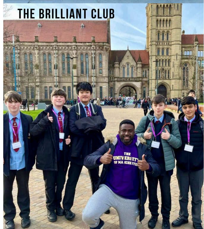
THE BRILLIANT CLUB